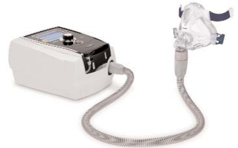
Stellar 100 and Quattro FX

ResMed is committed to developing innovative, effective and easy to use solutions to assist medical professionals in helping to improve the quality of life of patients.