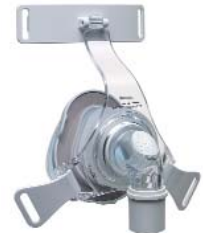
Philips Respironics' TrueBlue gel nasal mask

Philips Respironics is dedicated to helping caregivers establish better sleep and breathing for millions of people worldwide. Based on patients' unique needs, we develop solutions to encourage long-term compliance with therapy. The new TrueBlue gel nasal mask for sleep therapy delivers a higher degree of comfort, stability and the freedom to move with minimal adjustments.