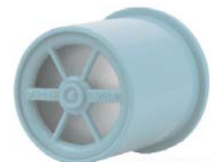
PMV® 007 (Aqua Color™)

It provides patients the opportunity to speak uninterrupted without having to wait for the ventilator to cycle and without being limited to a few words as experienced with "leak speech." By restoring communication and offering the additional clinical benefits of improved swallow, secretion control and oxygenation, the Passy-Muir Valve has improved the quality of life of ventilator-dependent patients for 25 years.