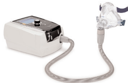
Stellar 100 and Quattro FX

ResMed is committed to developing innovative, effective and easy to use solutions to assist medical professionals in helping to improve the quality of life of patients.