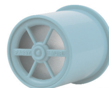
PMV® 007 (Aqua Color™)

It provides patients the opportunity to speak uninterrupted without having to wait for the ventilator to cycle and without being limited to a few words as experienced with "leak speech." By restoring communication and offering the additional clinical benefits of improved swallow, secretion control and oxygenation, the Passy-Muir Valve has improved the quality of life of ventilator-dependent patients for 25 years.