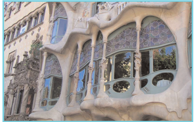
Located on Spain's northern Mediterranean coast, Barcelona is a showcase for Gaudí's dazzling architecture.