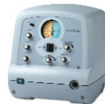
Philips Respironics' CoughAssist

Philips Respironics is focused on solutions for patients who suffer from chronic respiratory diseases. CoughAssist is a noninvasive therapy that safely and consistently removes secretions in patients with an ineffective cough. CoughAssist clear secretions by gradually applying a positive pressure to the airway, then rapidly shifting to a negative pressure, simulating a natural cough. http://coughassist.respirionics.com