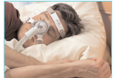
Philip Respironic's TruBlue Gel Nasal Mask

TrueBlue gel nasal mask from Philips Respironics utilizes Auto Seal technology for a flexible seal. Other features include a forehead pad with a soft premium blue gel, free-form spring and angled exhalation micro ports that rotate 360 degrees and redirect air away from a bed partner. Easy to remove the mask and lock in the same fit. Available in five sizes. www.healthcare.philips.com/us_en/homehealth/sleep/trueblue/index.wpd