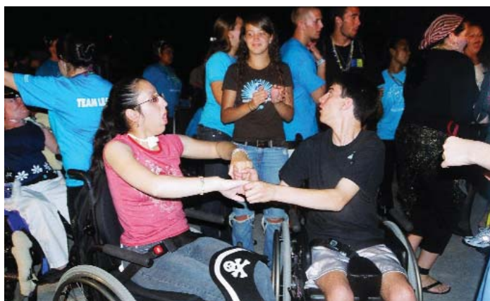
Dancing in chairs at Miami's VACC.