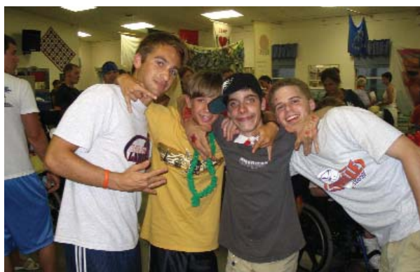
Smiles courtesy of Camp Victory, Millville, Pennsylvania